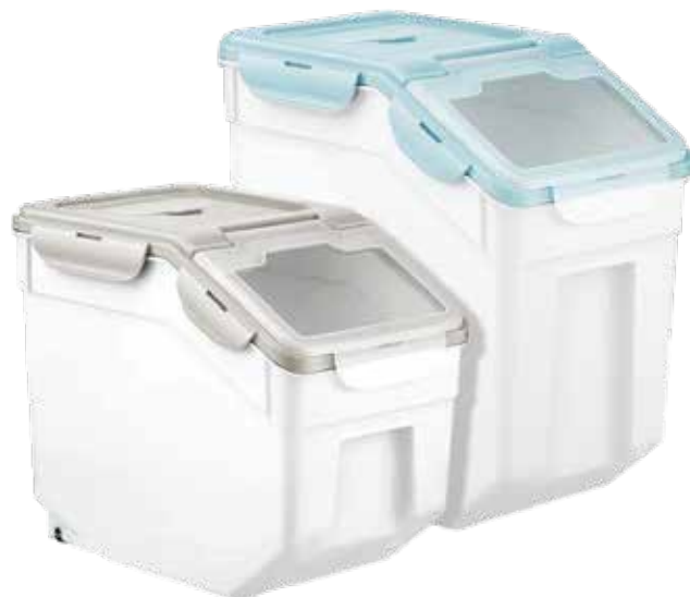
G2G Curing Containers

The G2G Plastic Curing Containers are engineered to provide easy access to the interior of the container while ensuring the containers remain air tight. All Plastic Curing Containers are made of food grade polypropylene and come equipped with a triple layer, moisture proof seal. Each G2G Plastic Curing Container possesses an air tight compartment to easily add any humidity packet or scent altering accessory. All G2G Plastic Curing Containers come installed with wheels which increase mobility of the containers. Available in two different sizes and two different colors.